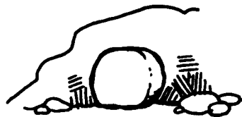
Jesus Was Buried