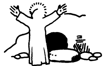
Jesus Rose Again!